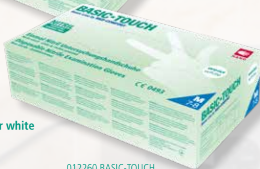
012260 BASIC-TOUCH Nitrile gloves powder-free, colour: white