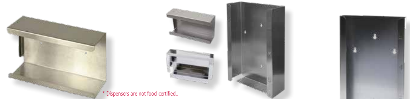
* Dispensers are not food-certified..