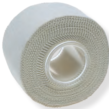
SoreProtect Proptape fixing plaster on a roll