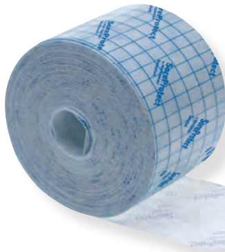
SoreProtect Sensplast fixing fleece