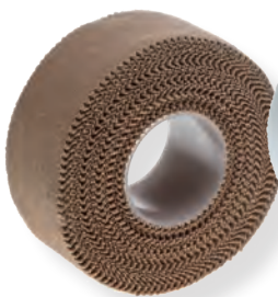
SoreProtect Stickplast fixing plaster on a roll