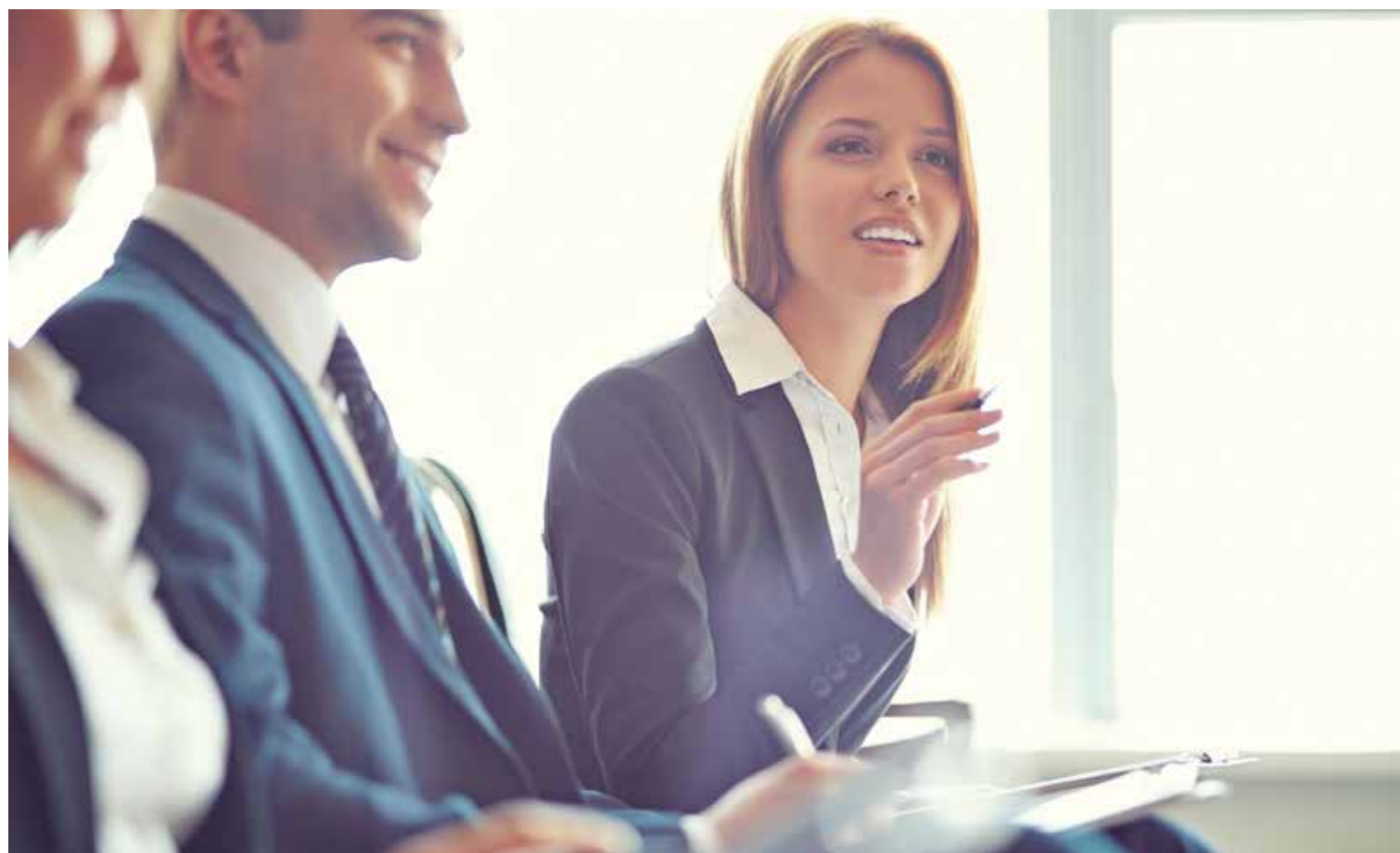
Keeping abreast of developments! Training courses tailor-made to you needs. From basic knowledge to expert knowledge.

We offer training courses for you to keep abreast of these developments. From basic knowledge to expert knowledge.